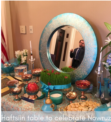
Haftsiin table to celebrate Nowruz

The API Legislative Caucus introduced legislative resolutions to recognize and celebrate the diversity of our communities and mark important milestones. These resolutions are important to increase awareness and visibility and share information about our cultural traditions.