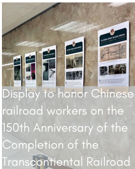
Display to honor Chinese railroad workers on the 150th Anniversary of the Completion of the Transcontinental Railroad