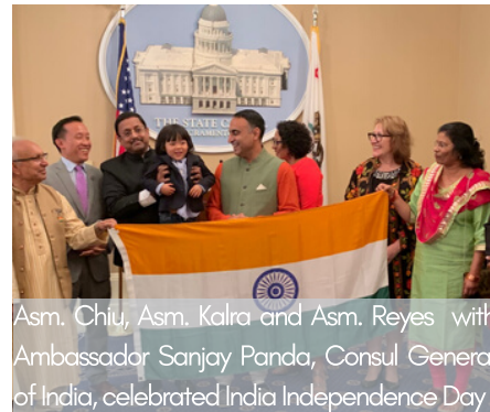
Asm. Chiu, Asm. Kalra and Asm. Reyes with Ambassador Sanjay Panda, Consul General of India, celebrated India Independence Day