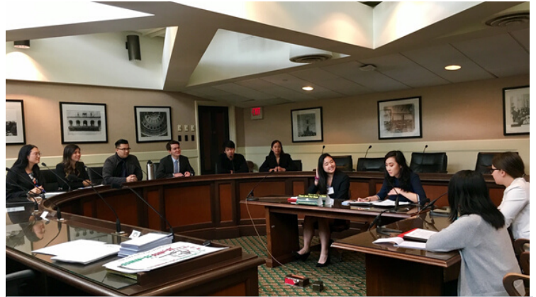
On Intern Day, interns learn about the legislative process and have an opportunity to conduct a mock legislative hearing