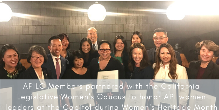
APIILC Members partnered with the California Legislative Women's Caucus to honor API women leaders at the Capitol during Women's Heritage Month