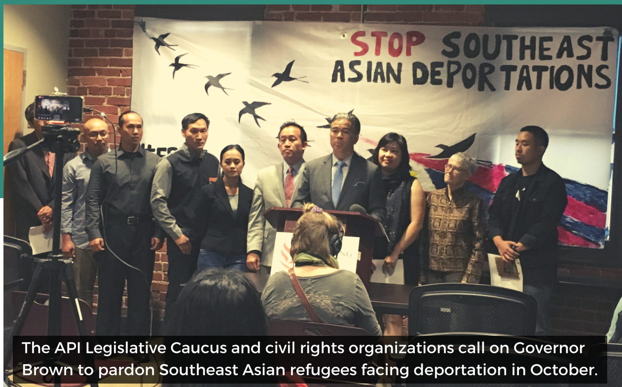
The API Legislative Caucus and civil rights organizations call on Governor Brown to pardon Southeast Asian refugees facing deportation in October.

The Caucus supported pardons for Southeast Asian Americans facing the threat of deportation. Four have received pardons so far. Although those convicted of crimes may spend years rehabilitating themselves into productive law-abiding residents, formerly incarcerated immigrants face the risk of being sent back to countries where they often have few, if any, ties. Many, such as Southeast Asian refugees, came here as children and don't know any other country than the United States.